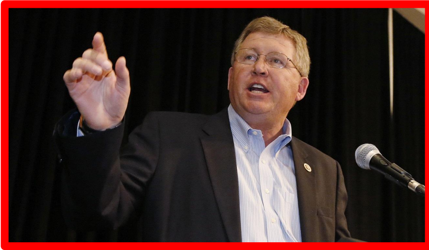
Science Chairman Frank Lucas